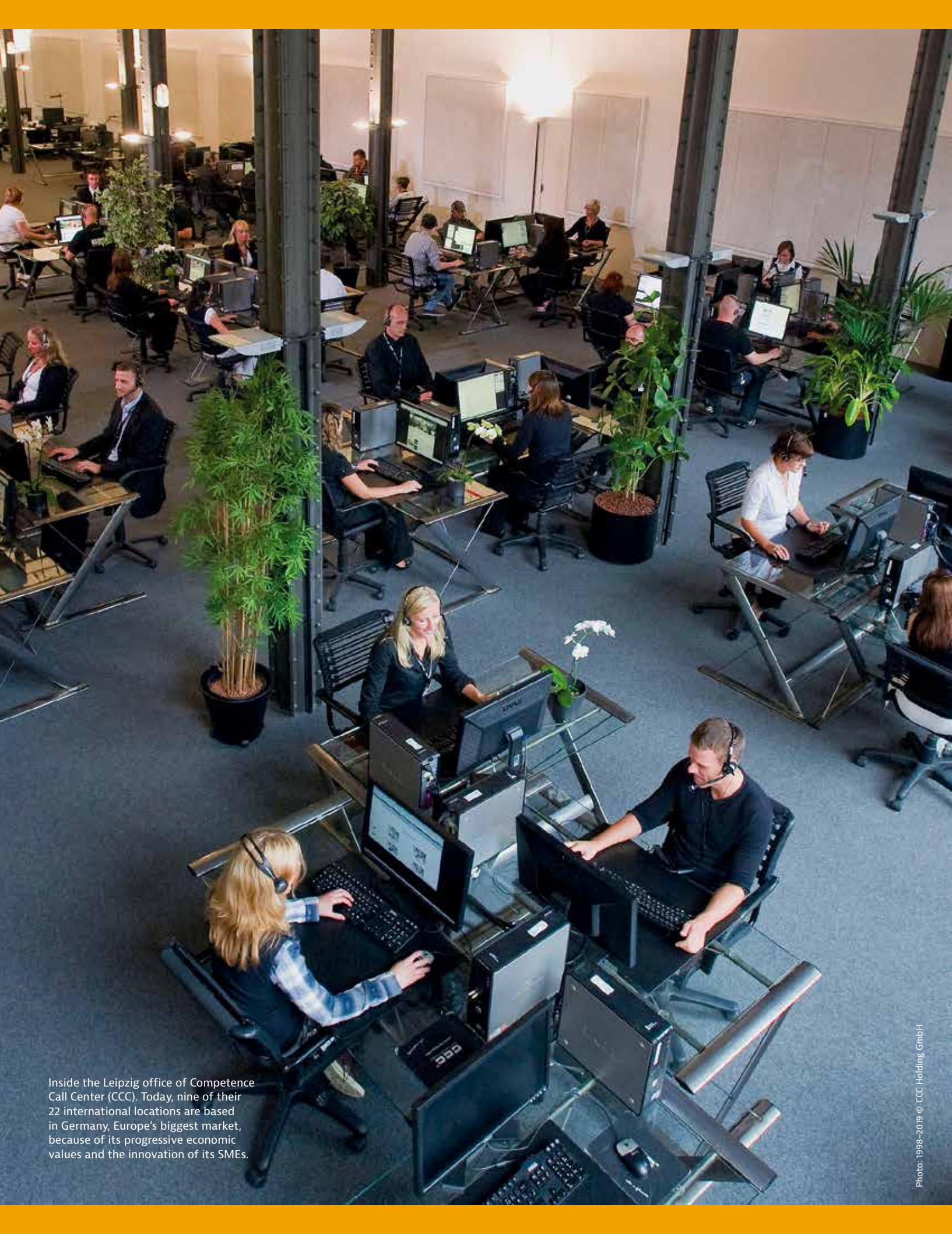
Inside the Leipzig office of Competence Call Center (CCC). Today, nine of their 22 international locations are based in Germany, Europe's biggest market, because of its progressive economic values and the innovation of its SMEs.